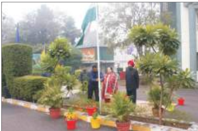
74 th Republic Day Celebrations, 2023