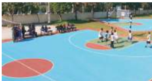
Synthetic Basketball Court