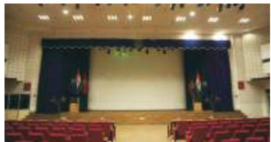
Multi Purpose Hall