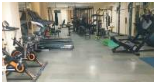
Modern equipments @ Gymnasium

(g) Gymnasium: A fully functional gym with modern machines and equipment is open to students.