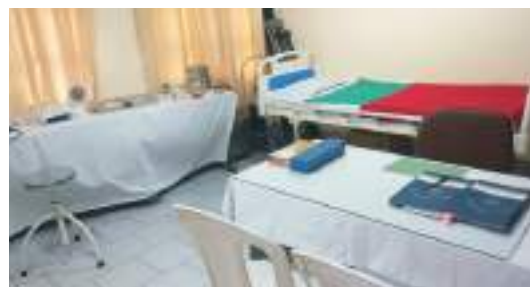
Medical Inspection Room

(d) Medical Care: All Students are expected to cater for their own medical care. If the student is a dependent of an Army Personnel, he/she is expected to carry the 'dependent card' for obtaining treatment at the Command Hospital, Chandimandir. Those students who are not dependent of Army Personnel must carry with themselves adequate health insurance cover. However, facility of an MI room has been provided in the campus.