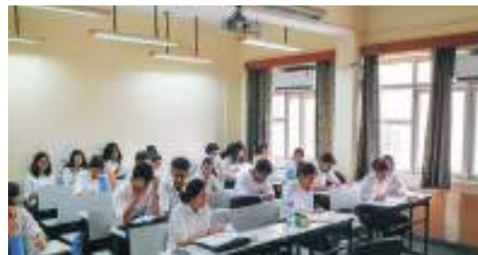
AC Class Rooms