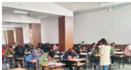
Well Maintained Exam Halls