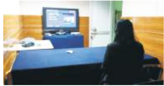
Video Conferencing Room.