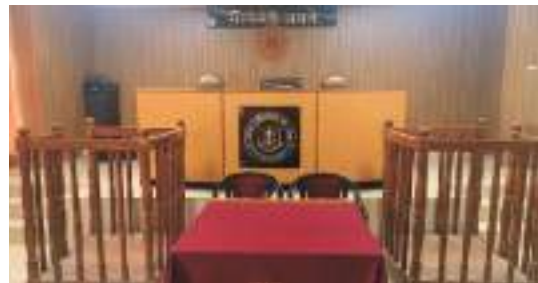
Moot Court Room