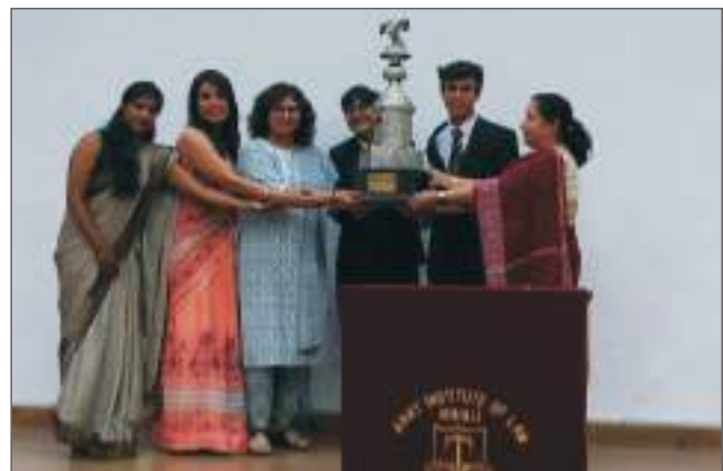
AIL Intra Institute Debate Championship Winners, 2022